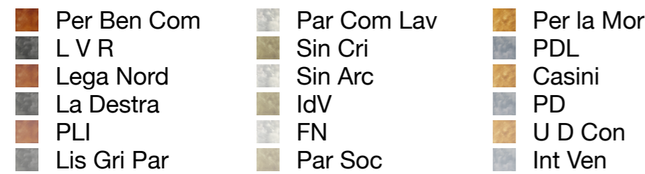
Voti Camera a Villafranca di Verona